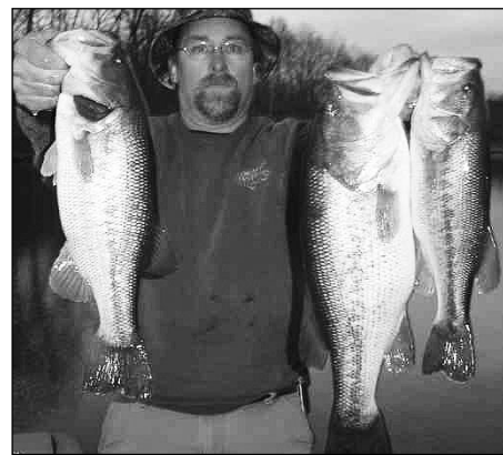
A six-pound largemouth bass along with a few others taken during the same evening on a jig-n-pig.

To book a trip for fall bass contact Jeff